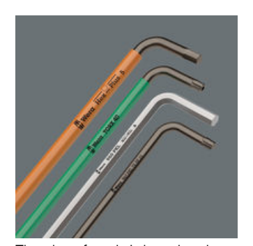
The size of each L-keys has been engraved by a laser. In addition SPKL L-keys have a colour coding according to sizes – for simple and rapid accessing of the required tool. Making it easy to find the right tool.