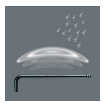
L-keys with BlackLaser surface treatment for outstanding surface protection and long service life. High corrosion protection.

Wera - 950/9 Hex-Plus 6 SB 05073596001 - 4013288106414