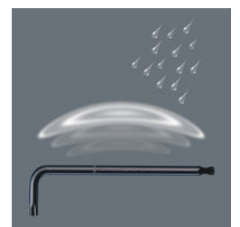
L-keys with BlackLaser surface treatment for outstanding surface protection and long service life. High corrosion protection.