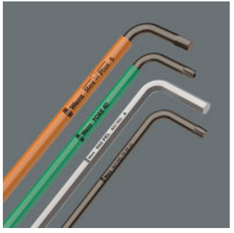
The size of each L-keys has been engraved by a laser. In addition SPKL L-keys have a colour coding according to sizes – for simple and rapid accessing of the required tool. Making it easy to find the right tool.