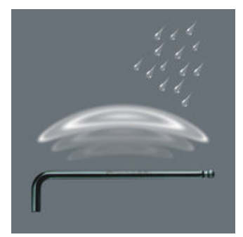
L-keys with BlackLaser surface treatment for outstanding surface protection and long service life. High corrosion protection.