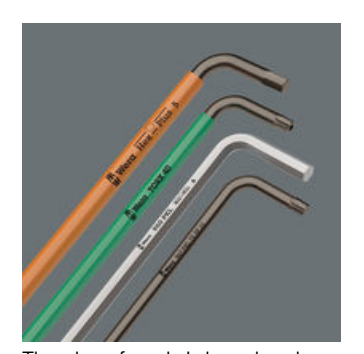
The size of each L-keys has been engraved by a laser. In addition SPKL L-keys have a colour coding according to sizes – for simple and rapid accessing of the required tool. Making it easy to find the right tool.