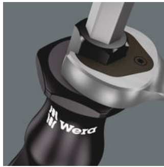
Hexagonal blade and bolster for higher torque transfer.