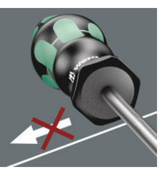
The hexagonal non-roll feature prevents any rolling away at the workplace.