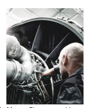
Kraftform Plus screwdrivers – ergonomics you can grasp. They relieve the entire hand-arm system even when used intensively. Along with other technical and product advantages such as the Lasertip for a secure fit in the screw head, Kraftform screwdrivers are the ideal choice whenever manual screwdriving jobs are concerned.