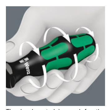
The hard materials used for the handle ensure rapid hand repositioning without any danger of the skin "sticking" to the handle. The surrounding hard zones with large diameters glide like wheels across the hand.