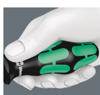
The large contact area – with particularly high friction to the soft zones – results in high torque transfer without any bruising from the edges.

The basic idea for the prototype of the Kraftform handle - that the hand should dictate the design has, right through to today, proved to be correct. In cooperation with internationally recognised the Fraunhofer IAO Institute, Wera developed a screwdriver handle designed to match the shape of the human hand as long ago as 1960s. After a long the development phase, the Wera Kraftform handle was launched to the market in 1968. It has been optimised through the years with new technologies, but has kept its proven shape. After all, the human hand has not changed either.