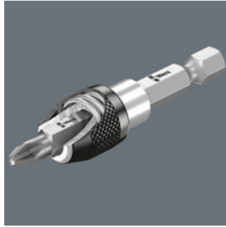
Universal holder with quick-release chuck

For a firm, wobble-free connection between holder and bit with quick-release action. Simply push sleeve forward to change bits. The magnetic design enables simplified positioning of the screw.