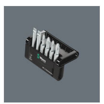
The Bit-Checks can be positioned upright at the workplace so the tool is always quickly to hand.