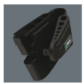
The wear-resistant clip material ensures that the L-keys are securely held yet are easy to remove.