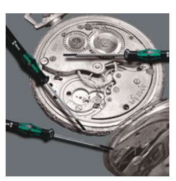
Indispensable for many users, including electronics technicians, opticians, precision engineers, jewellers, EDP hardware fitters and model-makers.