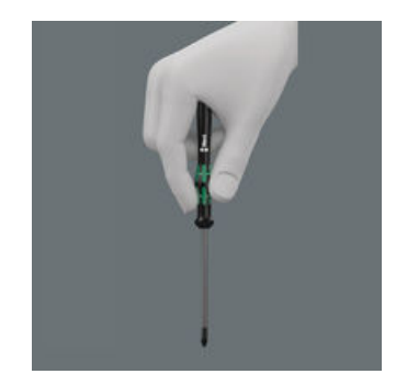
The Kraftform Micro, with its three zones and their specific arrangement, satisfies these requirements perfectly. The free-turning cap that provides support for the hand works with these advantages, enabling quick and easy precision work.