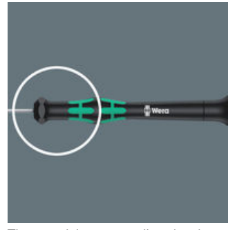
The precision zone directly above the blade gives the user a better feel for the right rotation angle during fine adjustment work.