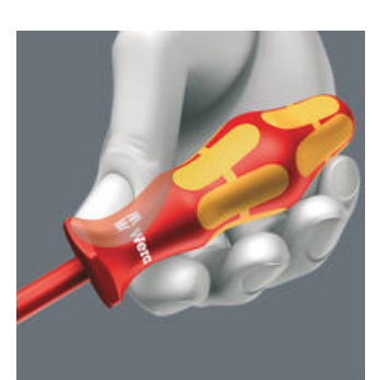
The outstanding design of the Kraftform handle that fits perfectly into the hand prevents hand injuries such as blisters and calluses.