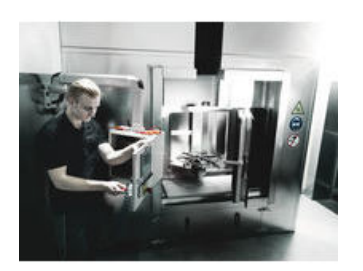
Our screwdrivers are tested for dielectric strength under a 10,000 volt load to make sure that their most important property, their insulation, has been exhaustively tested. Each individual Wera VDE screwdriver is subjected to this test to guarantee safe working up to 1,000 volts.