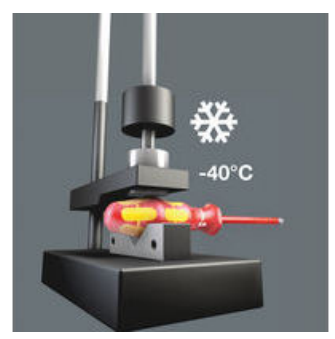
Impact strength tested at -40°C, guaranteeing safety even under extreme conditions.

The basic idea for the prototype of the Kraftform handle - that the hand should dictate the design has, right through to today, proved to be correct. In cooperation with the internationally recognised Fraunhofer IAO Institute, Wera developed a screwdriver handle designed to match the shape of the human hand as long ago as 1960s. After a long the development phase, the Wera Kraftform handle was launched to the market in 1968. It has been optimised through the years with new technologies, but has kept its proven shape. After all, the human hand has not changed either.