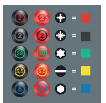
Screwdrivers with "Take it easy" tool finder: colour coding according to profile and size stamp.

The hard materials used for the handle ensure rapid hand repositioning without any danger of the skin "sticking" to the handle. The surrounding hard zones with large diameters glide like wheels across the hand.