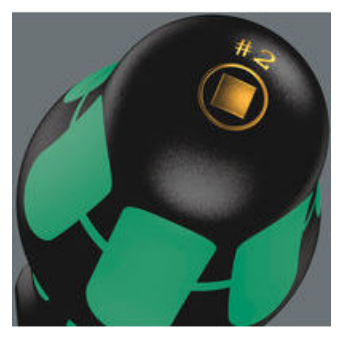
The screw symbol and tip size identification markings on the handle make it easier to find the right screwdriver in the tool case or at the workplace.