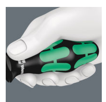
The large contact area – with particularly high friction to the soft zones – results in high torque transfer without any bruising from the edges.