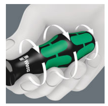
The hard materials used for the handle ensure rapid hand repositioning without any danger of the skin "sticking" to the handle. The surrounding hard zones with large diameters glide like wheels across the hand.