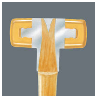
The double-sided conical design creates an unbreakable and secure link between the handle and head of the hammer.