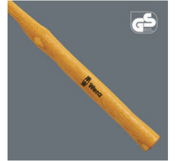
Powerful work is ensured with handles out of high quality ash wood.