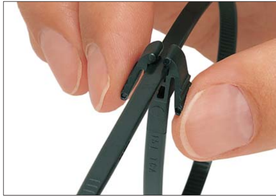
The REZ ties have a one-hand, simple, release mechanism.

These releasable and reusable ties are ideal for temporary installations or the addition and/or removal of cables. Suitable for a multitude of uses, such as the packaging industry as a bag closure where access to part of the bag contents may be needed but the bag needs to be re-sealed (example - milk powder in the catering industry).