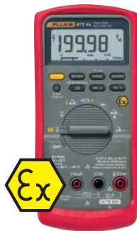
Fluke 87V Ex