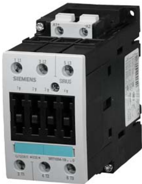
CONTACTOR, AC-3 22 KW/400 V, DC 24 V, 3-POLE, SIZE S2, SCREW CONNECTION