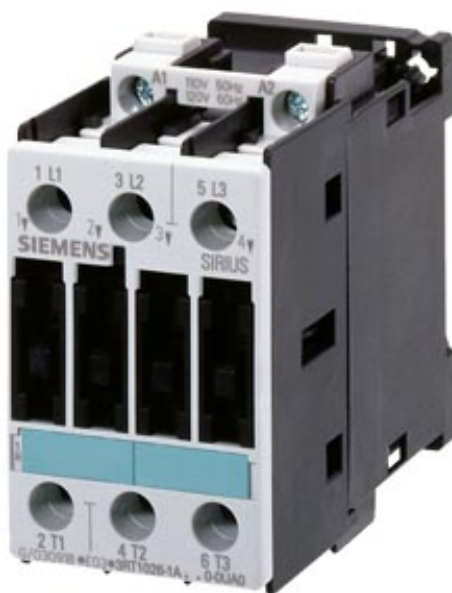
CONTACTOR, AC-3 11 KW/400 V, DC 24 V, 3-POLE, SIZE S0, SCREW CONNECTION