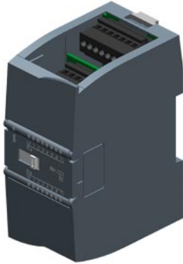
SIMATIC S7-1200, Digital input SM 1221, 16 DI, 24 V DC, Sink/Source