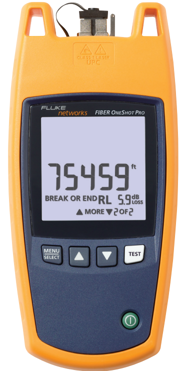
Fiber OneShot PRO

Most troubleshooting solutions for today's fiber network are inefficient and take too much time. Simple tools like lasers (VFLs) are easy to operate but extremely repetitive and tiresome; most VFLs have distance limitations of 2 or 3 miles (3,218 or 4,828 metres). At the high end, Optical Time Domain Reflectors (OTDRs) can work as troubleshooters but their advanced analysis and trace capabilities are better suited for certifying and documenting cable installation quality. What field technicians really need is a first-line diagnostic tool that locates fiber cabling problems accurately, the first time. Fiber OneShot PRO's simple, one-button test feature, its speed and its distance capability make it your perfect frontline fiber troubleshooter.