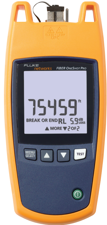
Fiber OneShot PRO

Most troubleshooting solutions for today's fiber network are inefficient and take too much time. Simple tools like lasers (VFLs) are easy to operate but extremely repetitive and tiresome; most VFLs have distance limitations of 2 or 3 miles (3,218 or 4,828 metres). At the high end, Optical Time Domain Reflectors (OTDRs) can work as troubleshooters but their advanced analysis and trace capabilities are better suited for certifying and documenting cable installation quality. What field technicians really need is a first-line diagnostic tool that locates fiber cabling problems accurately, the first time. Fiber OneShot PRO's simple, one-button test feature, its speed and its distance capability make it your perfect frontline fiber troubleshooter.