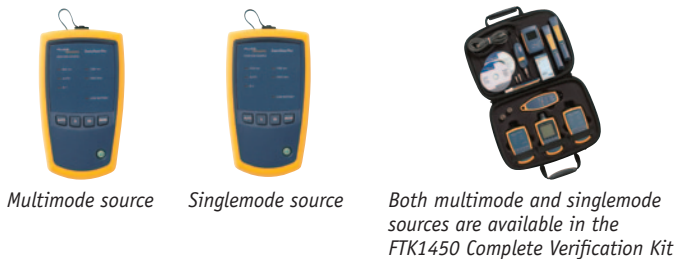
Multimode source Singlemode source Both multimode and singlemode sources are available in the FTK1450 Complete Verification Kit