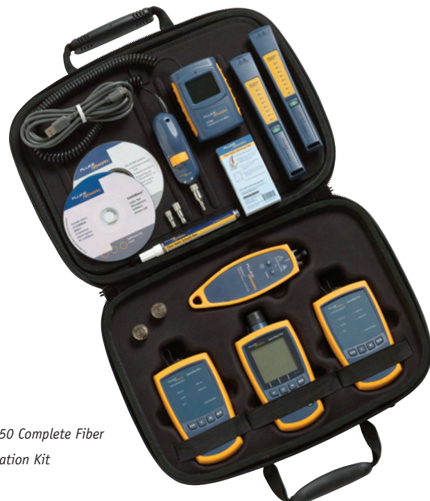
FKT1450 Complete Fiber Verification Kit