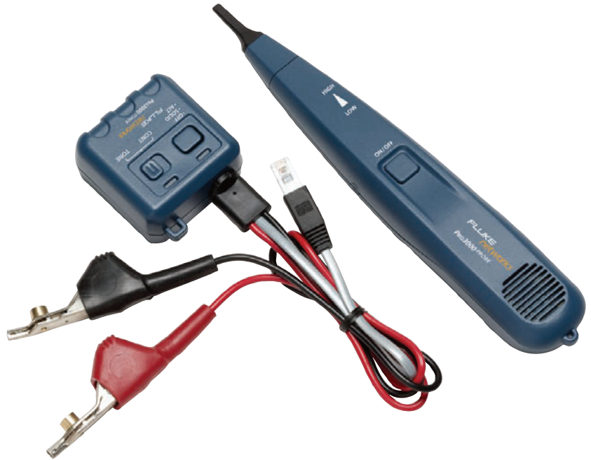
Pro3000 Toner and Probe

The Pro3000 Analog Tone and Probe are your best choice for toning and tracing wire on non-active networks, and specifically for identifying individual pairs with SmartTone™ technology. Angled bed-of-nails clips allow easy access to individual wires, and the RJ11 connector is ideal for use on telephone jacks. The large loud speaker on the probe allows you to hear through drywall, wood or other enclosures to find wires quickly and easily. You can send this loud tone up to 10 miles on most cables! Attach the nylon pouch to your belt, and you will be equipped for any wire identification job.