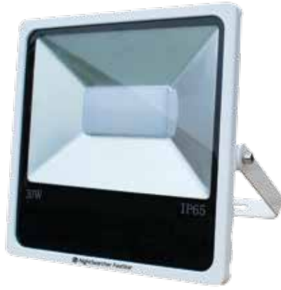
30W - 2400 Lumens