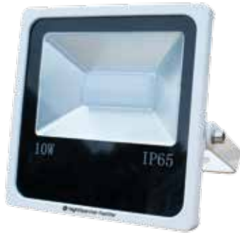
10W - 800 Lumens