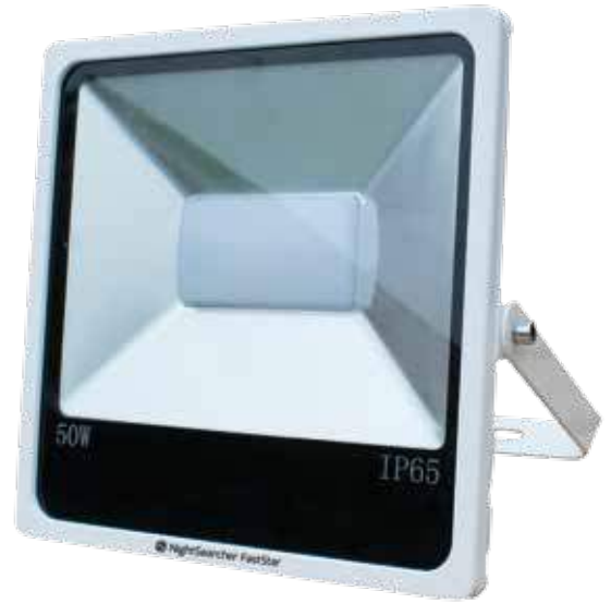
50W - 4000 Lumens