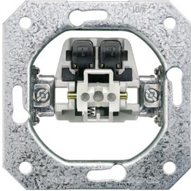
DELTA pushbutton device insert, UP 1 NO, 10A 250V