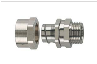
Helaguard SCSB-SM Swivel External Thread.