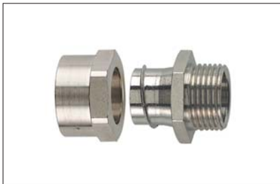
Helaguard SCSB-FM Fixed External Thread.