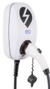
eoBasic Charging Station