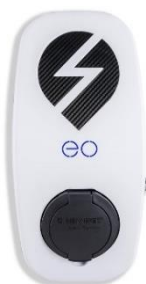
eoGenius Charging Station