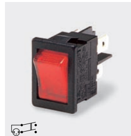
H8553VB --- T8553VB ---