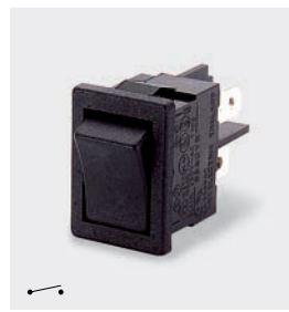
H8550VB --- T8550VB ---