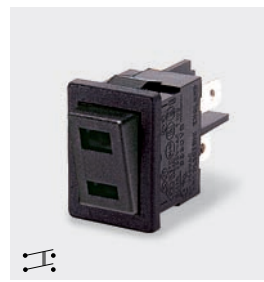
H8550HB --- T8550HB ---