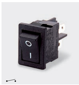
H8500VB --- T8500VB ---