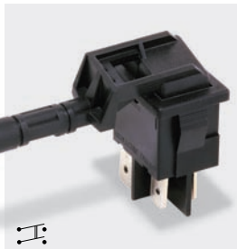
H8550RB Semi-rotary A splash proofing option