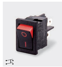
H8550XB --- T8550XB ---