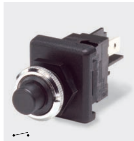
H8500PO --- Pushbutton option