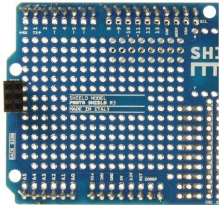
Proto Shield R3 mounted Back