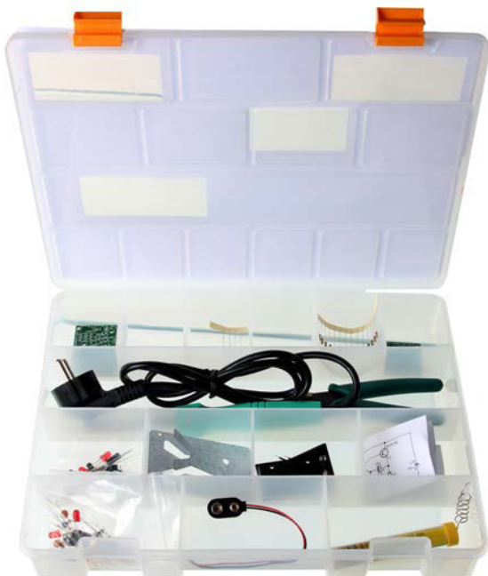
Handy storage box