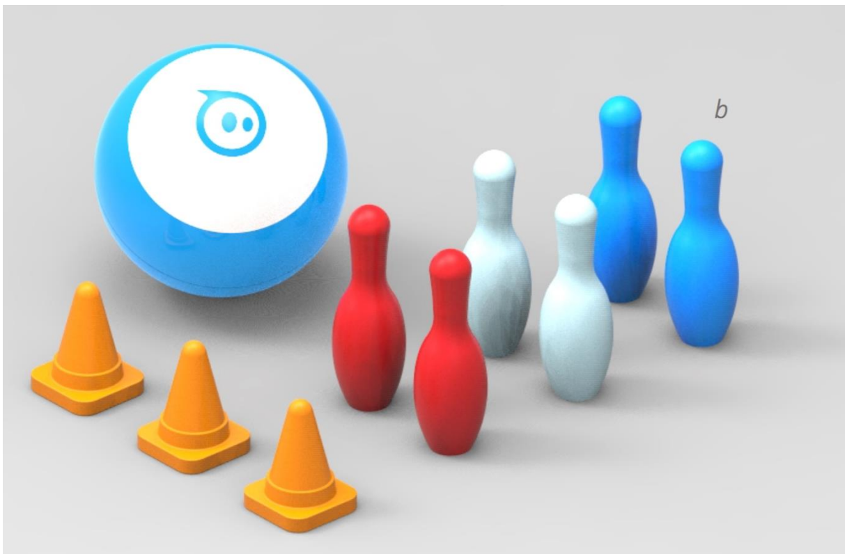
Photo of Sphero Mini complete set