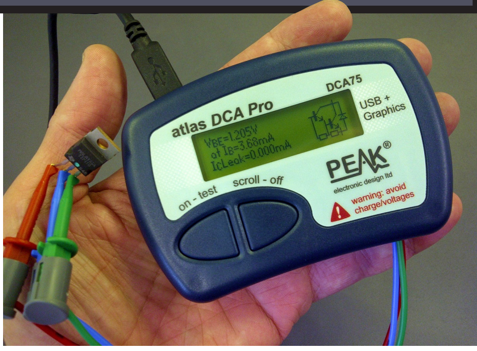
Detailed component information on your PC, complete with curve tracing functions.