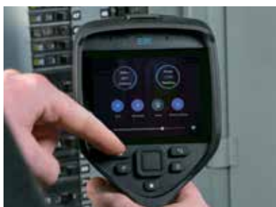
Streamlined data collection and sharing speeds analysis and repairs