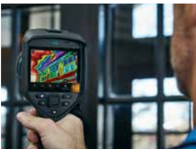
One-handed operation with convenient buttons for safe, streamlined use