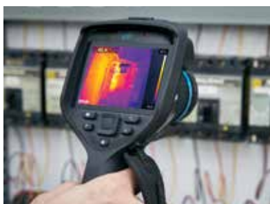
One-handed operation with convenient buttons helps maintain workplace safety