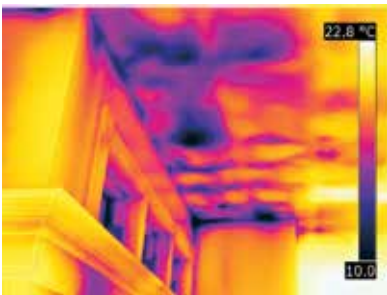
Quickly detect moisture intrusion and building deficiencies