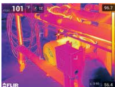
Find problems quickly and eliminate costly plant shutdowns