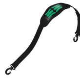
Wera 2go 6 05004355001 1 x 38.0x1470.0