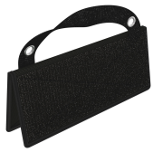
Wera 2go 5 05004354001 1 x 135.0x300.0x270