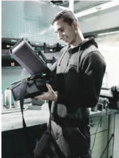
Wera 2go 1 – The outside packer