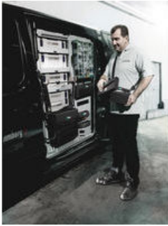
Wera 2go 1 – The outside packer