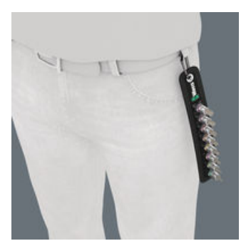
The robust textile belt can be secured to a belt loop or pocket by means of the snap hook.