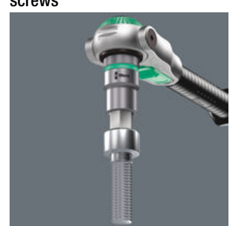
The clamping of the screw is achieved by a flexible locking ball. The holding function is especially helpful in confined, hard-to-reach spaces, where there is no room for a second hand to secure the screw.