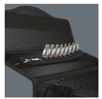
The textile belt can be attached by means of the nonwoven reverse side and the hook and loop strips e.g. to a wall, shelf, tool trolley and to the Wera 2go tool transport system.