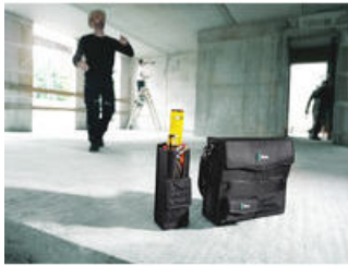
Wera 2go 7 high tool box.