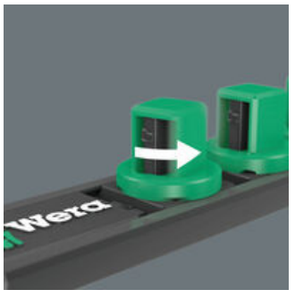
With its twist-to-unlock mechanism the socket rail ensures easy access of the sockets. At the same time the sockets are held securely.