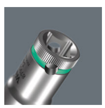
Knurling on lower end for more grip when used manually.