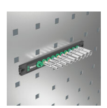
Thanks to the magnet, the rail is suitable for temporary attachment to the wall, shelf or workshop trolley.