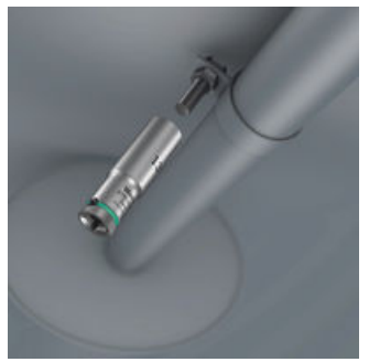
Due to the long design of the socket, screwdriving can also be achieved in small spaces. Fittings with protruding threaded rods are often also possible.