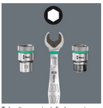
Take it easy tool finder system - with profile and size colour-coding for quick and easy tool selection. Colour-coded system for hexagon drive screws (L-Keys, Zyklop bit sockets), external hex drive screws and nuts (Joker wrenches, Zyklop sockets and Zyklop bit sockets with holding function), and TORX® drive screws (L-Keys, Zyklop bit sockets).