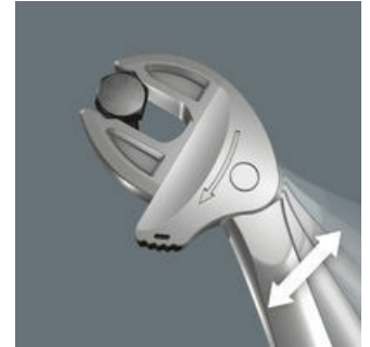
Joker 6004: Ratchet mechanism for fast work

The ratchet function in the mouth sees to fast and consistent screwdriving without removing the tool.