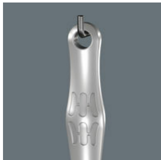
Joker 6004: Useful hole for hanging

Thanks to its hole the Joker can be neatly hung on the workshop wall.