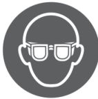
Wear eye protection