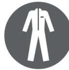
Wear protective clothing