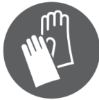
Wear protective gloves