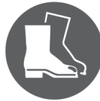
Wear safety footwear