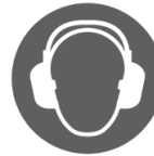
Wear ear protection