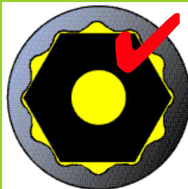
"Draper Expert HI-TORQ"™