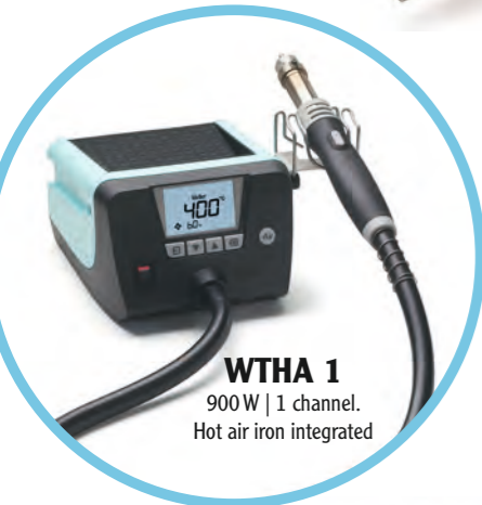
WTHA 1 900 W | 1 channel. Hot air iron integrated